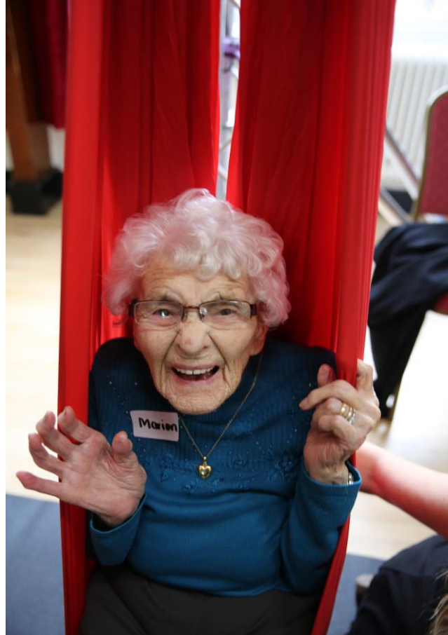
Physical Activity in the Community - Sunderland Thriving Communities