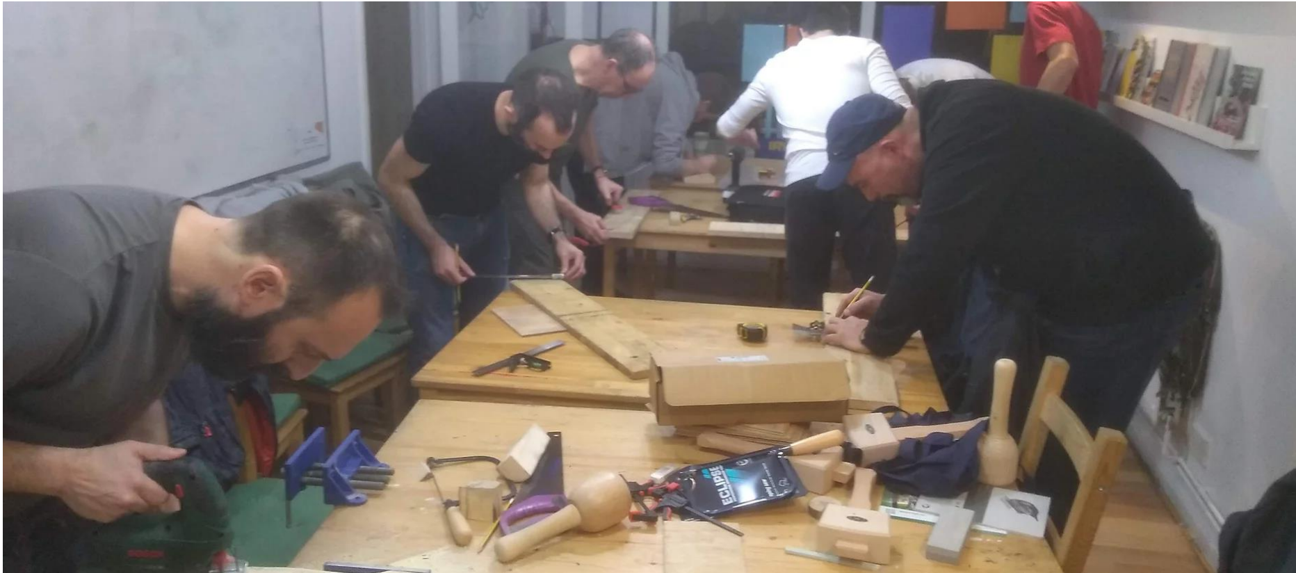
Woodworking for Wellbeing - St Margaret's House, London