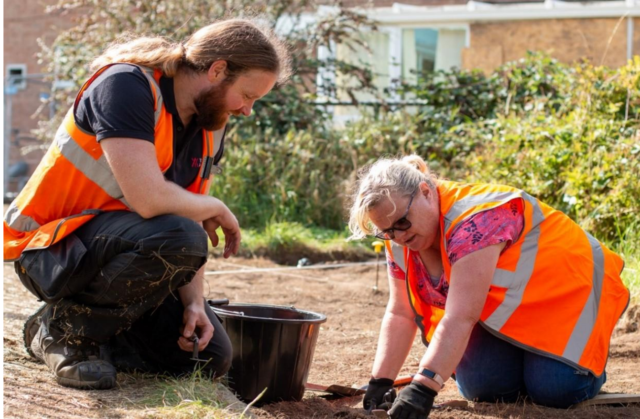
Archaeology on Prescription - York Archaeology